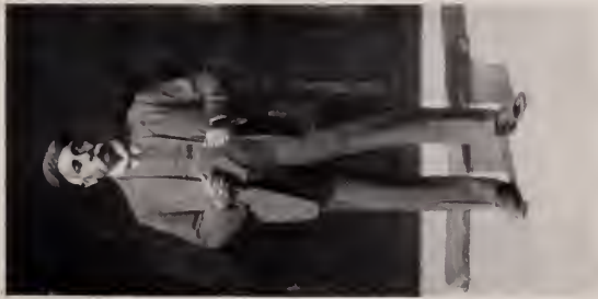
The Prime Minister of Baroda